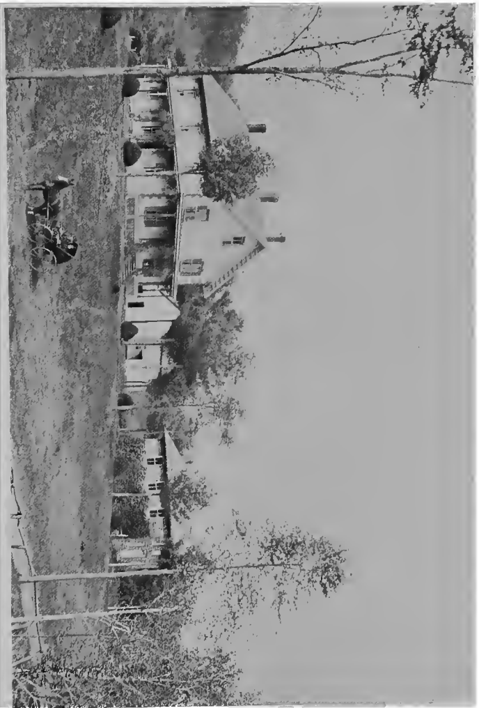
Bryant Library Buildings.